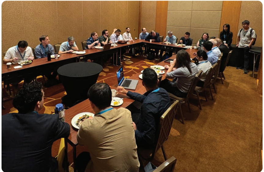
FIGURE 1 TC-ES members attend our lunch meeting at CDC 2023 in Singapore in December 2023.

By combining both committees, the TC-ES aims to address the challenges and opportunities posed by this energy transformation, fostering interdisciplinary collaboration and innovation.